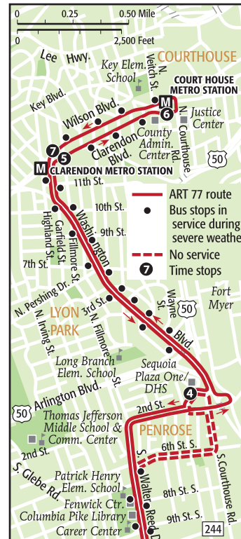
See southern portion of route at right